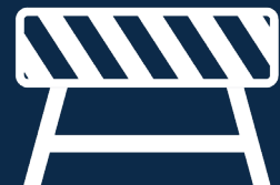
closed common areas