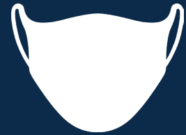
masks and neck gaiters for all students & staff