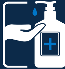
hand sanitizing stations