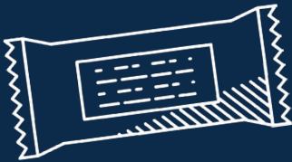
pre-packaged snacks delivered during breaks to classrooms