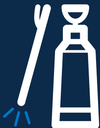
backpack sprayers to clean heavily visited areas