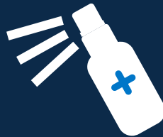
cleaning of high-traffic, high-touch areas