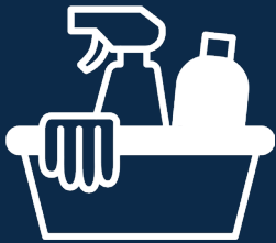
cleaning kits in every classroom